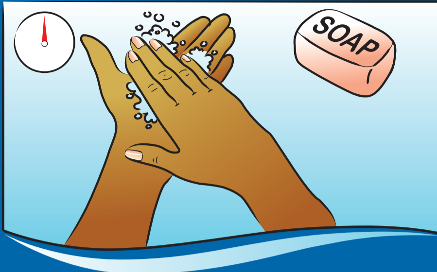
Lather hands with soap and water and rub hands palm to palm