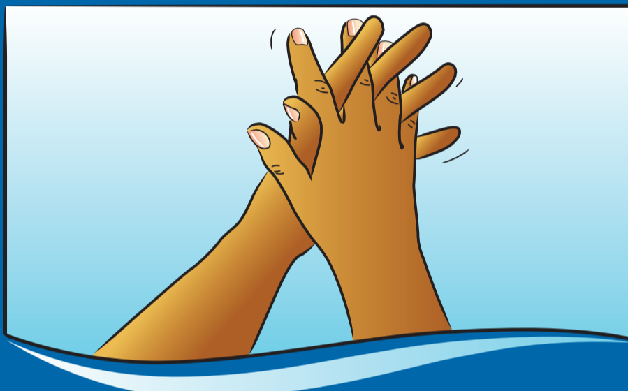
Palm to palm with fingers interlaced