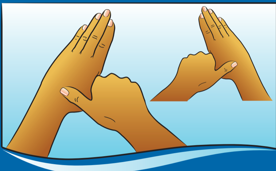
Rotational rubbing of left thumb clasped in right palm and vice versa