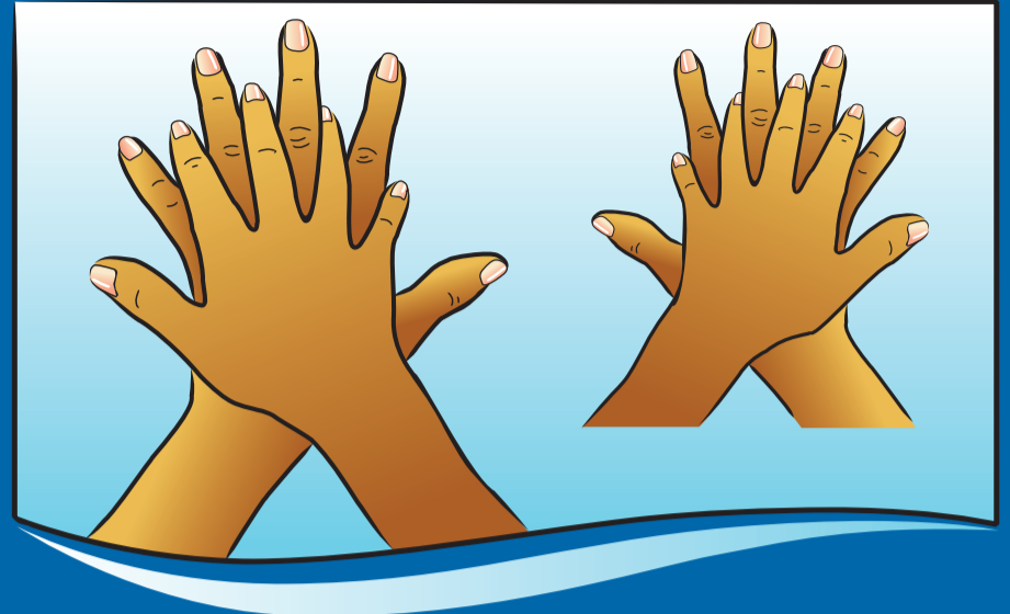
Right palm over back of left hand with interlaced fingers and vice versa