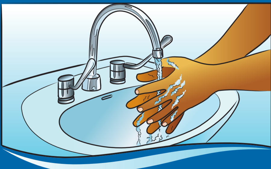
Rinse hands with water