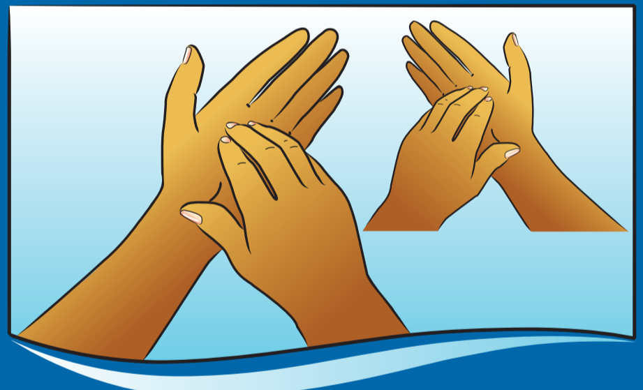
Rotational rubbing backwards and forwards with clasped fingers of right hand in left palm and vice versa