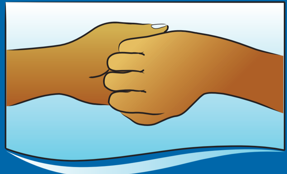
Backs of fingers to opposing palm with fingers interlocked