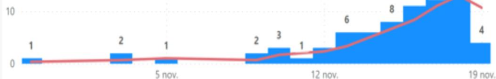
Cumulative trends on the daily ILI cases per date of illness onset

● Somme de Casesatcutoff ● 3 days moving-average